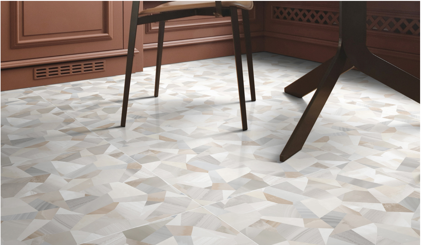
Milano Decor Ambra (Beige)