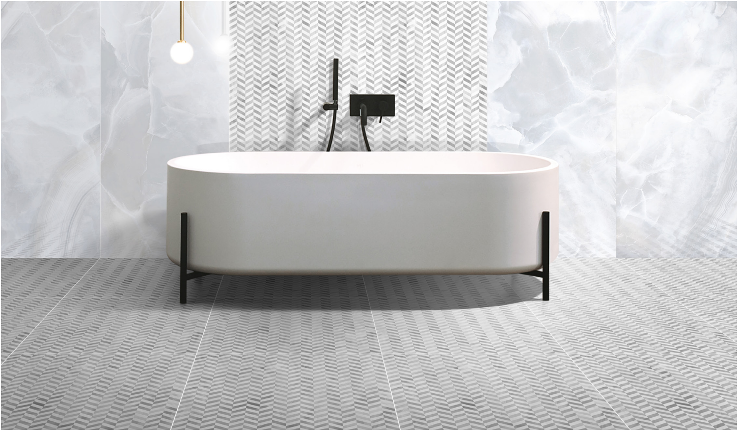
Bianco White & Simila Decor Bianco (White)